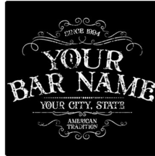
Design name: FUN ON TAP