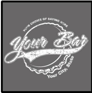
Design name: BOTTLECAP

All sweatshirts will be printed on the front as shown below with the back blank.