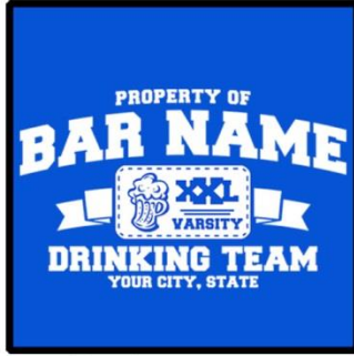
Design name: DRINKING TEAM WHISKEY LABEL